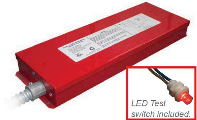
LED Test switch included.